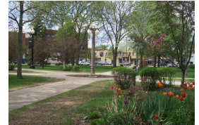
Use public spaces as places to celebrate community

It's not enough to have a public space as a focal point of downtown. While it can be a great signature piece, Library Square should be programmed with events that celebrate community and attract people to downtown. The nearby Farmers Market is exactly that kind of event.