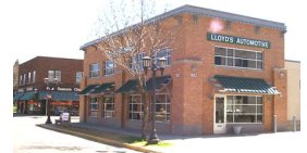
Expect buildings to acquire "historic" status

Historic buildings cannot be built today, and simple replication of historic styles will only serve to diminish the integrity of truly historic structures. Buildings created for downtown Hutchinson should be representative of their own time, and be built with the sense that, one day, they too will become a part of downtown's historic fabric.