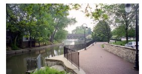
Embrace the river as the community's place