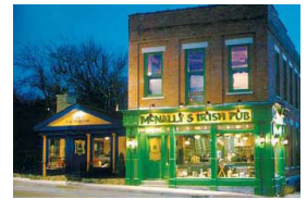
Invite retail activity to Main Street

As a natural resource, the Crow River in downtown should be a great public place. The goal should be a continuous, publicly accessible riverfront throughout downtown.