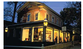
Surround downtown with vital living areas