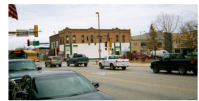
Accept traffic on downtown's terms

Traffic is necessary to support the business activities of downtown, but it should occur in the context of a vital and pedestrian-oriented place. From this perspective, it is important to consider traffic flow, but also to control the speed at which traffic moves.