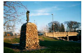
Set up special elements as focal points and highlights of the downtown experience

There should be points of special character in both the public and private realms of downtown, elements that are unique and memorable. Historic buildings such as the State Theater and the Hutchinson Hotel can be great focal points; the power plant might someday have a similar quality. As streetscapes are developed, the introduction of public art that celebrates Hutchinson's heritage might offer elements that are more delightful or whimsical, and most important, more memorable.