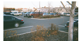
Build parking for pedestrians

Once a driver parks their car, they become a pedestrian. Parking lots, therefore, should offer continuity with other pedestrian spaces of downtown, with a similar degree of attention to aesthetics. In doing so, the spaces are "humanized" and become more comfortable places for people, and they offer greater consistency with other improvements in downtown.