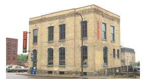
Allow uses to change, not buildings

The best downtown buildings are those that encourage their continual evolution within the same basic structure. This kind of use will allow the building stock to maintain its value and its place in the long-term perspective of downtown.