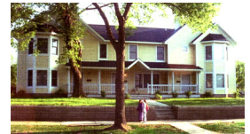
Provide housing for a wide range of lifestyles

Downtowns can be attractive to a range of residents, each with their own preferences for a living environment. Most important, there is no single dwelling unit that can be a universal fit, so a range of housing choices must be provided with a character befitting downtown Hutchinson.